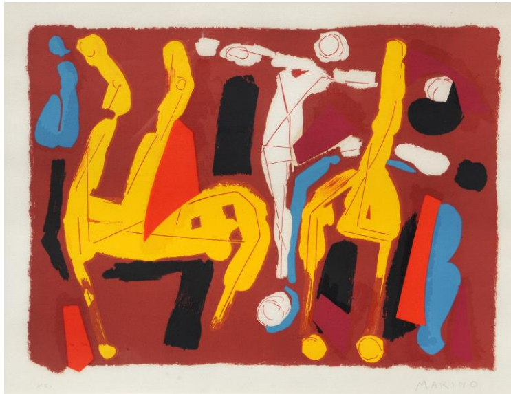
Marino Marini, Chevaux et Cavaliers , 1973

Messums West, 5 October 2024 - 6 January 2025